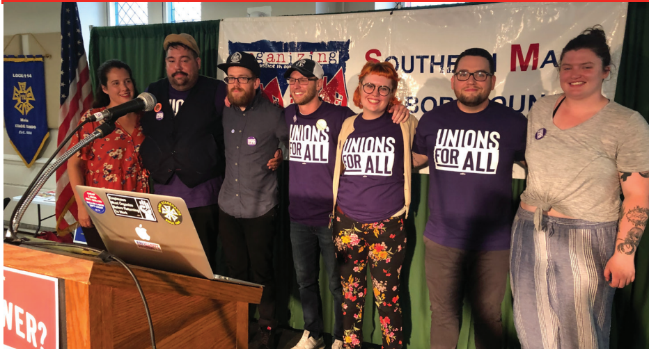
Members of the new Preble Street union were honored at the 2019 Southern Maine Labor Council Labor Day Breakfast in Portland.

Across the state, we've seen an increase in union organizing. Working people have been coming together to improve their workplace and demand a voice on the job. Workers at Preble Street came together over the past year and in June won an election to form their union, affiliated with the Maine State Employees Association, SEIU 1989 . The social workers, case managers, cooks, and other staff organized to address high turnover rates and low pay so they can better serve their clients at the agency.