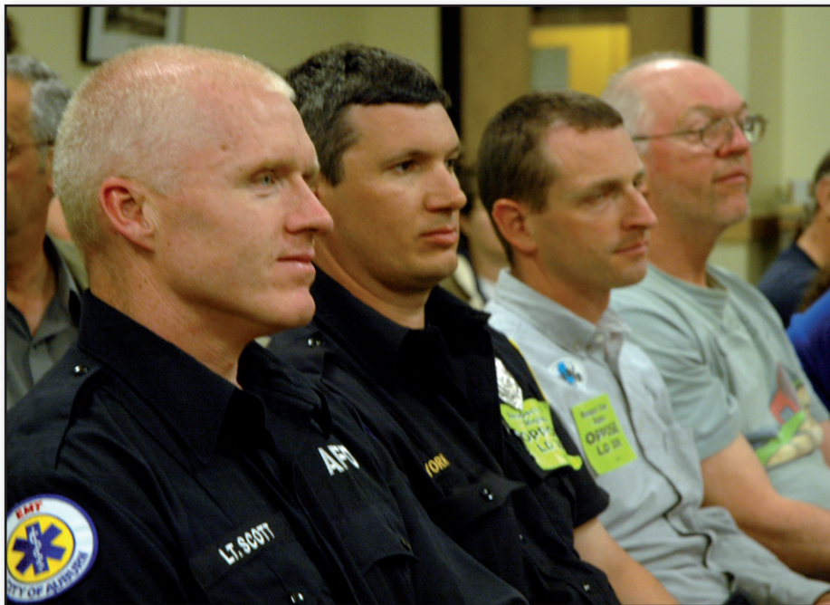
Members of the Professional Fire Fighters of Maine at legislative hearing.

The Professional Fire Fighters of Maine worked very hard to defeat Governor Paul LePage's proposal to raid the retiree health care trust for public safety employees. They were able to rally members to fill the seats of the Appropriations and Financial Affairs Committee, email and call committee members and in the end receive a unanimous bi-partisan vote to exclude the Governor's proposal to balance the budget on the backs of Maine's retired first responders.