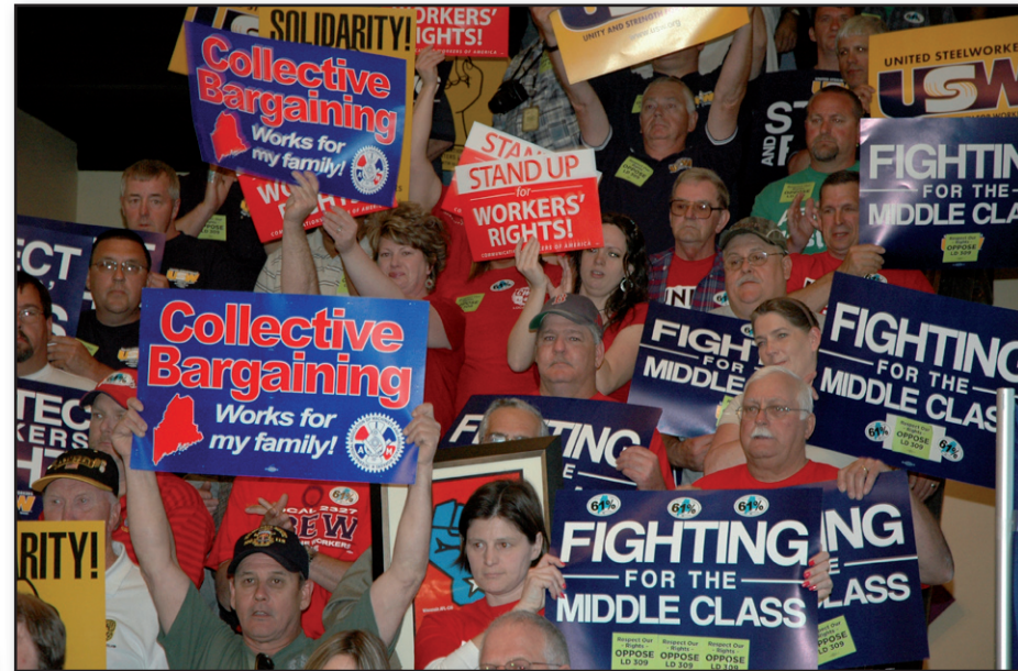
Union members and allies demonstrating in big numbers against LD 309, public sector Right to Work for Less legislation on June 2, 2011.