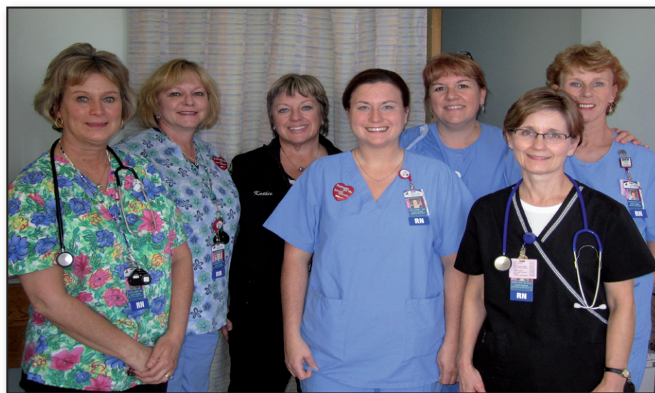
MSNA nurses from Eastern Maine Medical Center in Bangor.

LD 472 was signed into law this June. This bill requires hospitals to have a security plan in place by January with a reporting mechanism as well as protections for those who report violence or the threat of violence in the hospital setting. Between 8 -13 percent of emergency-room nurses are victims of physical violence every week, according to a survey released last September by the Emergency Nurses Association. The rate of assault injures to psychiatric nurses has been estimated at 16 per 100 employees per year, which exceeds the annual rate of all injuries found in many high risk occupations. This bill will save lives and hospitals will be safer. Congratulations to the Maine State Nurses Association for their hard work lobbying to pass LD 472!