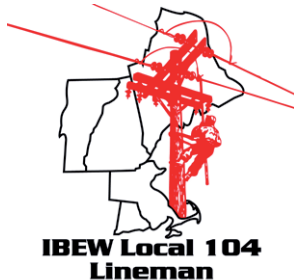
IBEW Local 104 Lineman