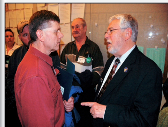
Union members jammed the halls of the State House in Augusta for a Labor Lobby Day on March 22, 2011.