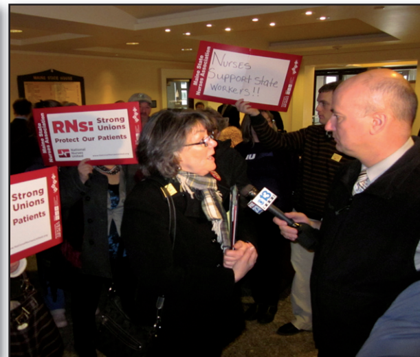
Inside and outside of the State House in Augusta, workers were out in force on many occasions during the 2011 legislative session, and we'll be back in 2012!