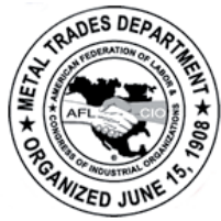
Metal Trades Council at Portsmouth Naval Shipyard